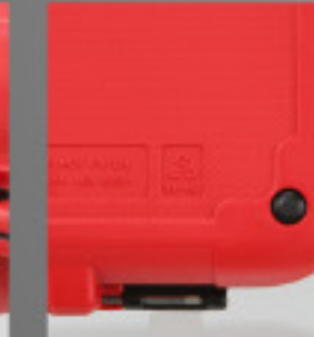
Clearly Viewable Secure Design Dual-Color Design